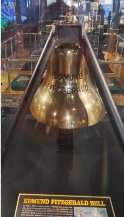
July 2024, Great Lakes Shipwreck Museum

It is important to remember those who lost their lives in this and other tragedies so that they will not have died in vain. They should and will be remembered for their contribution to society and each of our lives. Perhaps studying what happened could help to improve boatbuilding policies as well as regulations regarding when ships are allowed to be out on the waters.